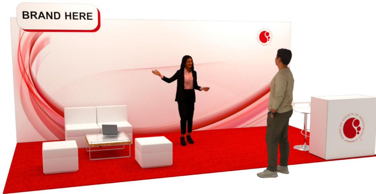
Diamond: 18m 2 (6x3)