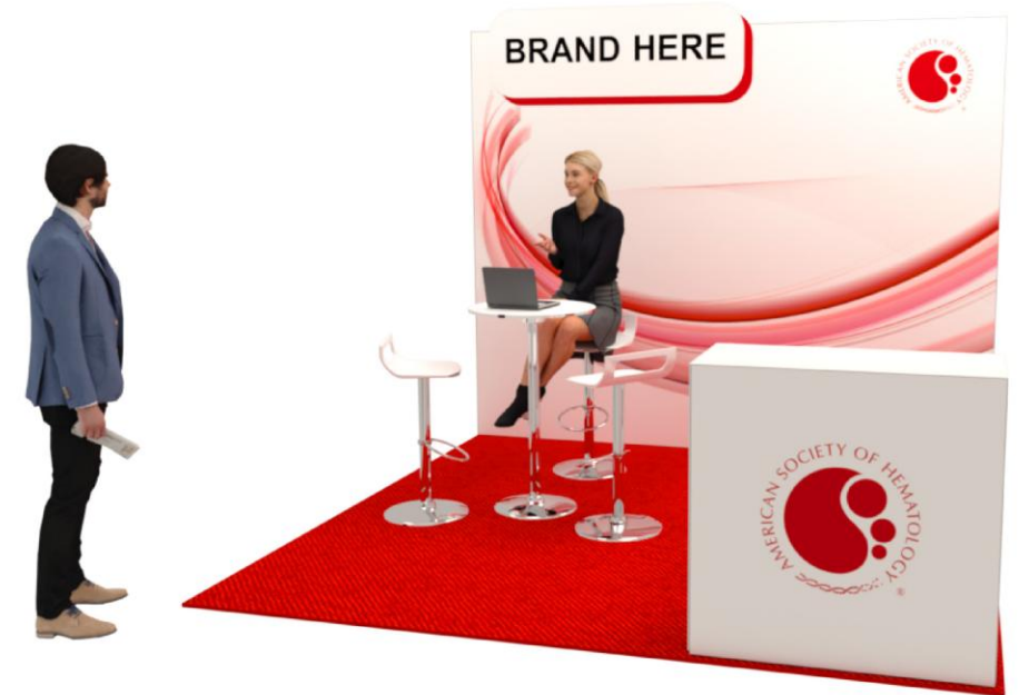
Gold: 12m 2 (4x3)

Sponsors may customize their booth as long as it is done through the official builder and in compliance with the exhibitor manual guidelines. Any additional costs will be borne by the exhibitor.